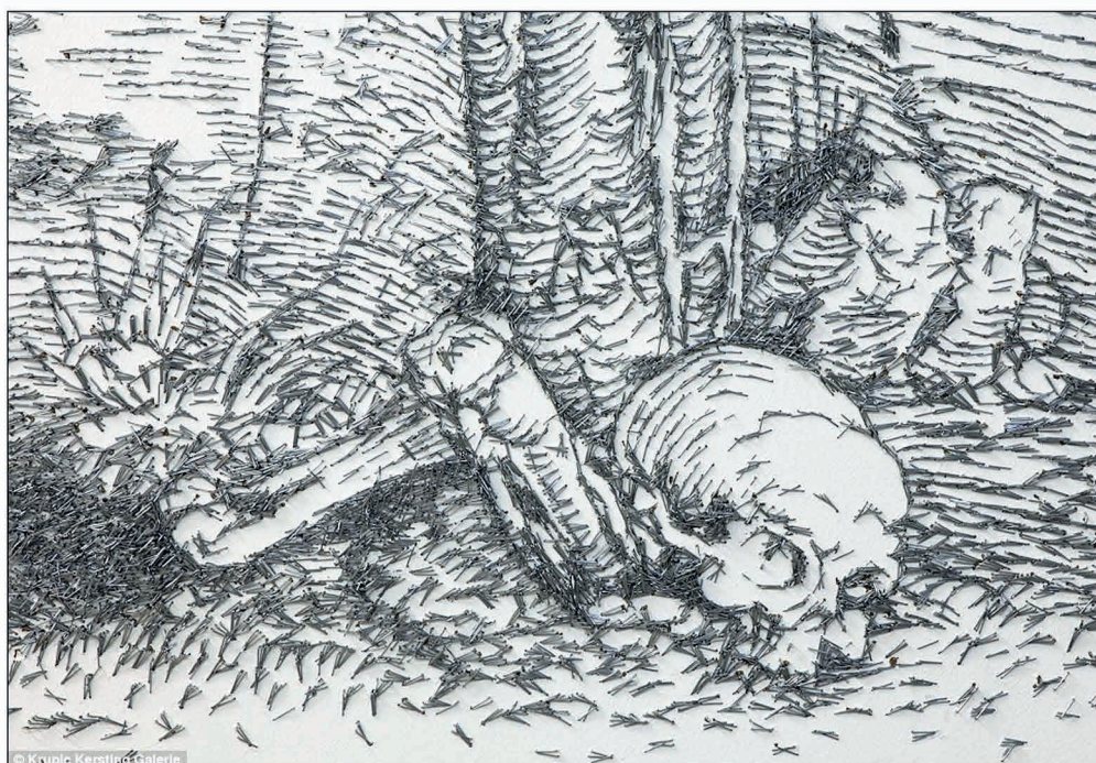
Intricate: A close up of the art work reveals the level of detail which has gone into it