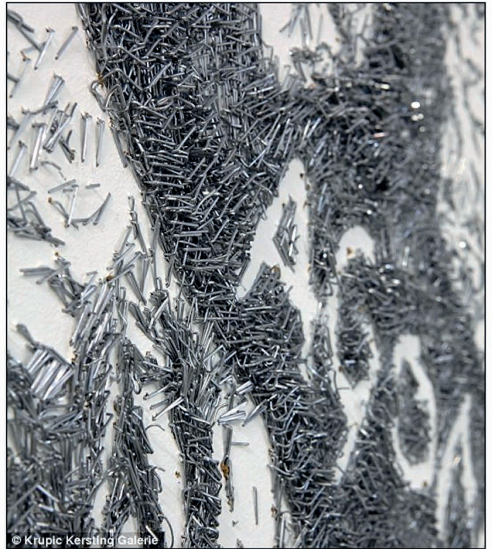
Metal murals: The artist combines classic styles with edgy contemporary twists in his celebrated work, entitled Agony in the Garden