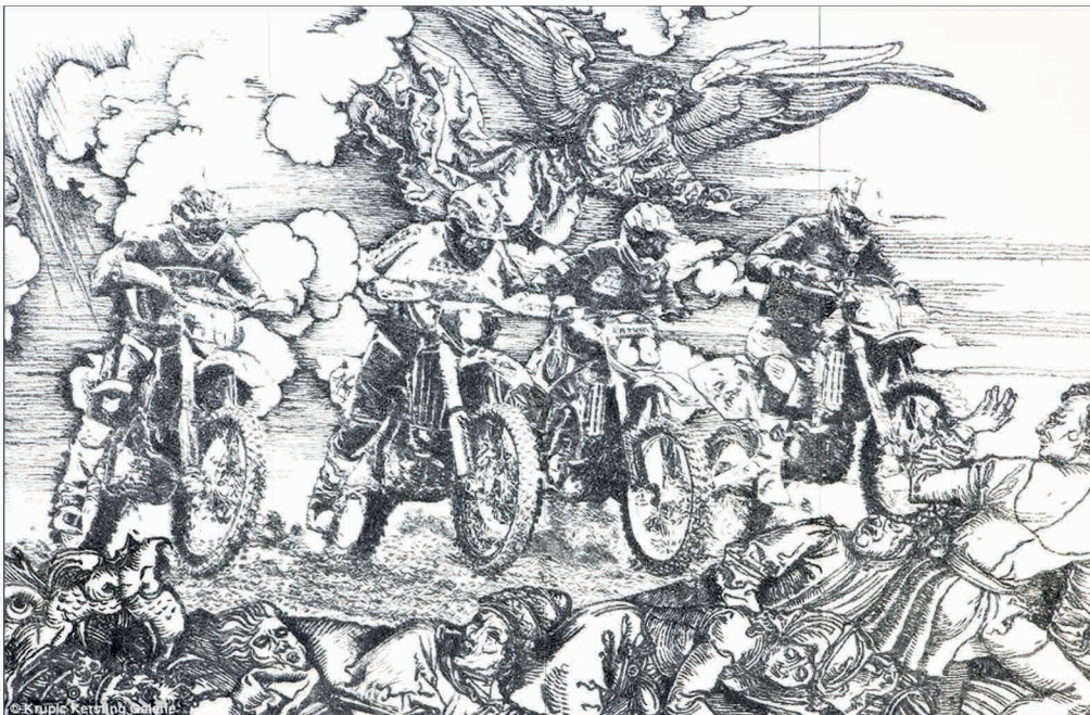
Got it nailed: The artist has used hundreds of thousands of staples to create magnificent art works

For most of us staples are little more than a basic office accessory. But for French artist Baptiste Debombourg the tiny pieces of metal are the tools with which he creates these detailed masterpieces. The artist is displaying his work at the Krupic Kersting Gallery, in Cologne, Germany.