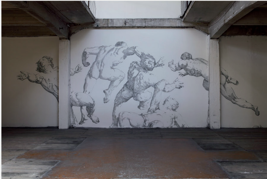
Baptiste Debombourg, Aggravure III , staples installation on the wall, 4x11m, 2011, Courtesy Galerie Patricia Dorfmann-Paris

As an homage to the technique of engraving, Debombourg used 450,000 staples in his site-specific work, choosing his materials based solely on where the piece will be exhibited. "My sculptural work is generally part of a contextual approach, and I operate in a space with materials chosen specially for it," the French artist says on his website .