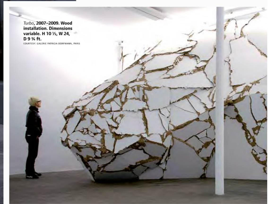
Turbo , 2007–2009. Wood installation. Dimensions variable. H 10 ½, W 24, D 9 ¾ ft.