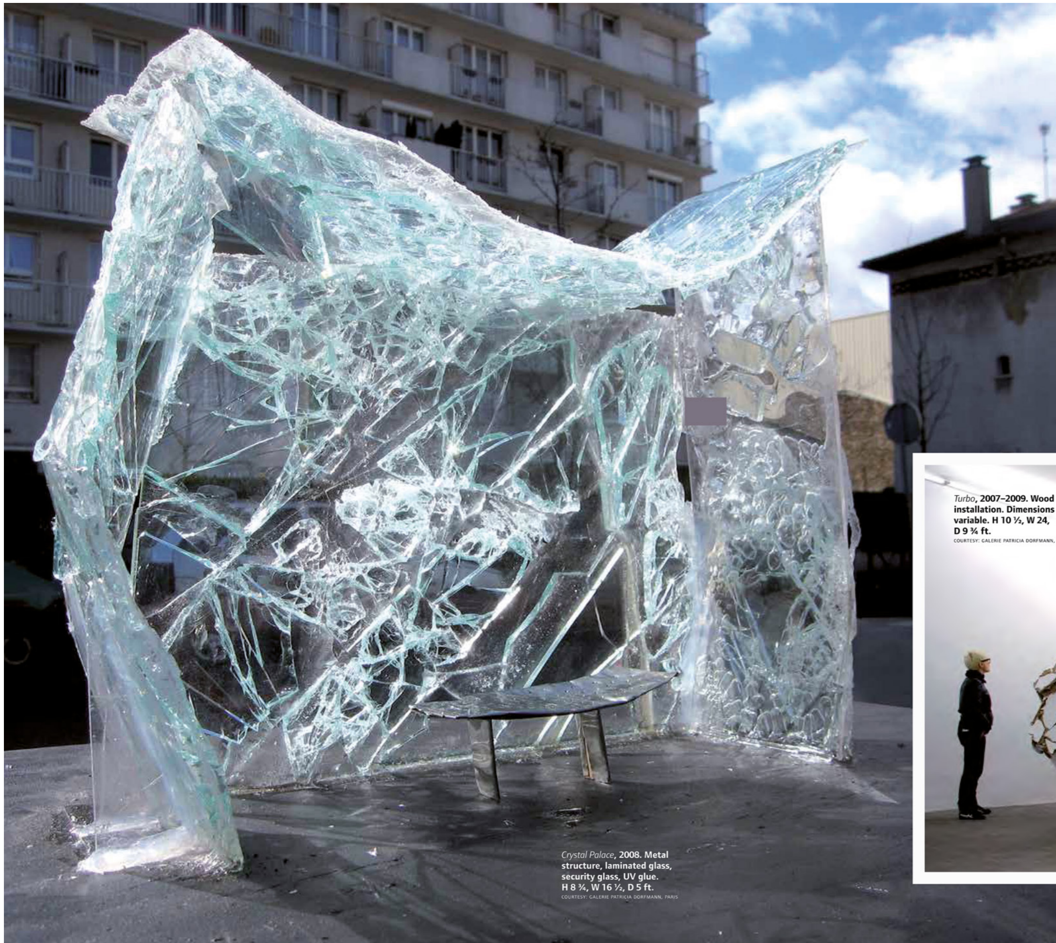
Crystal Palace , 2008. Metal structure, laminated glass, security glass, UV glue. H 8 ¾, W 16 ½, D 5 ft.