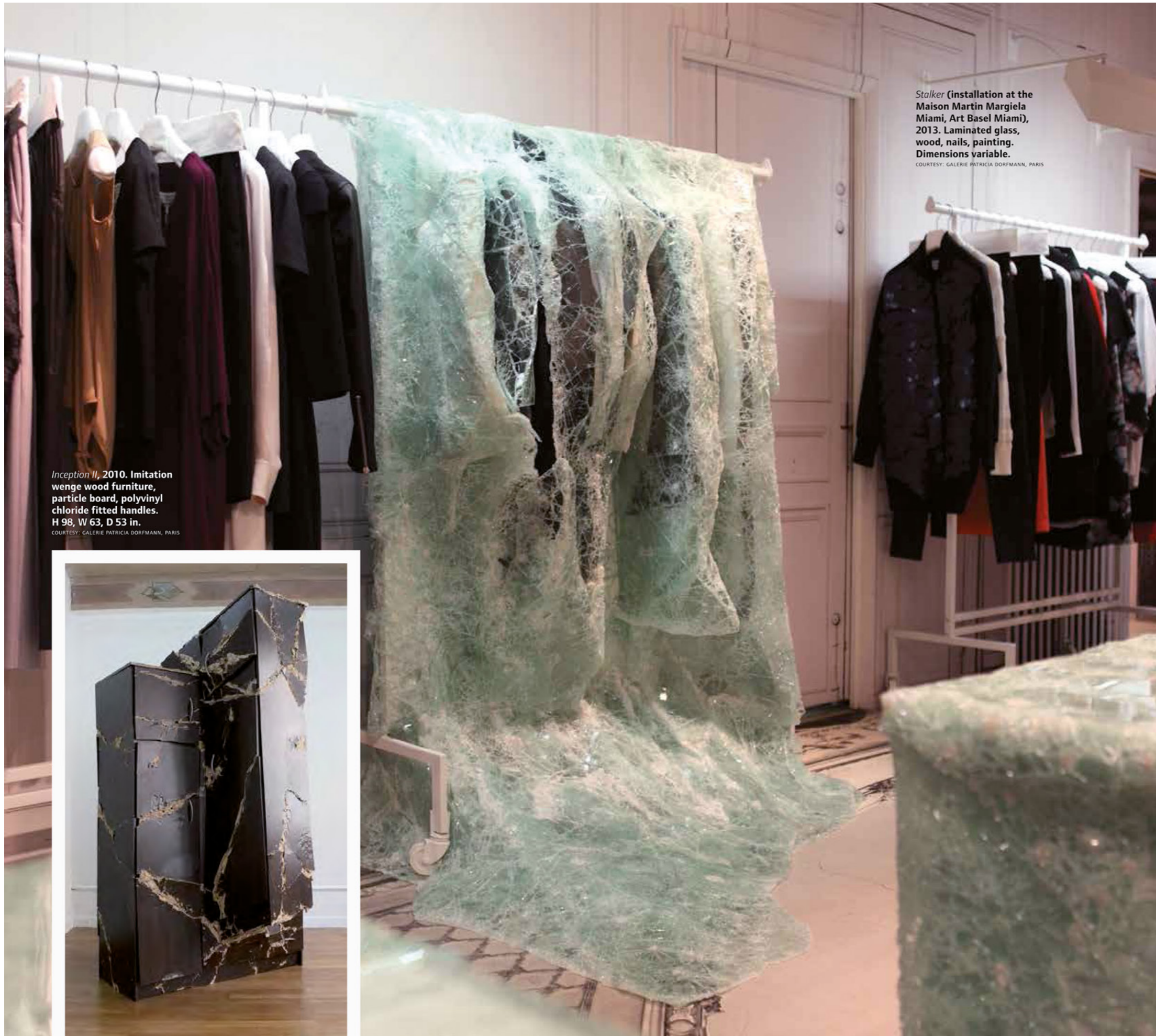
Stalker (Installation at the Maison Martin Margiela Miami, Art Basel Miami), 2013. Laminated glass, wood, nails, painting. Dimensions variable.