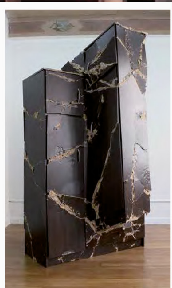
Inception II, 2010. Imitation wenge wood furniture, particle board, polyvinyl chloride fitted handles. H 98, W 63, D 53 in.