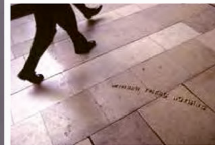
Work in the "Social Philosophy" series, 2008. Analog photo, Diasec process. Dimensions variable.